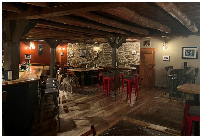
STURBRIDGE | PUB