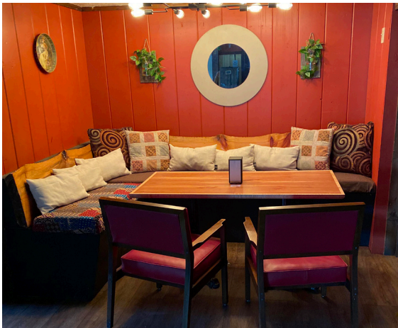
Nook (part of main dining area)