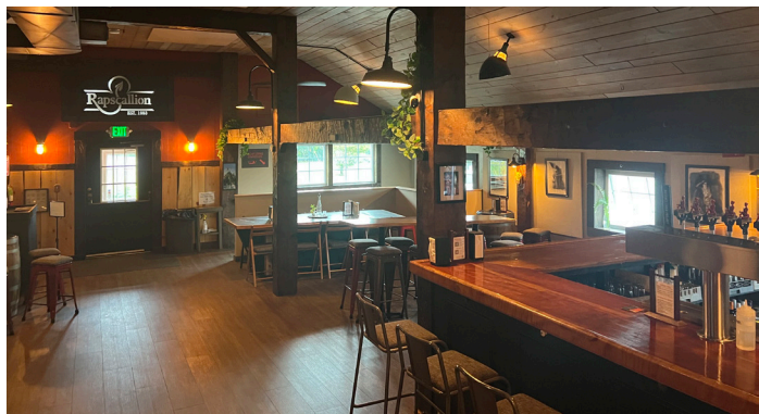
Upstairs Main Room