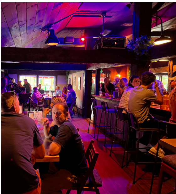
Upstairs Side Room