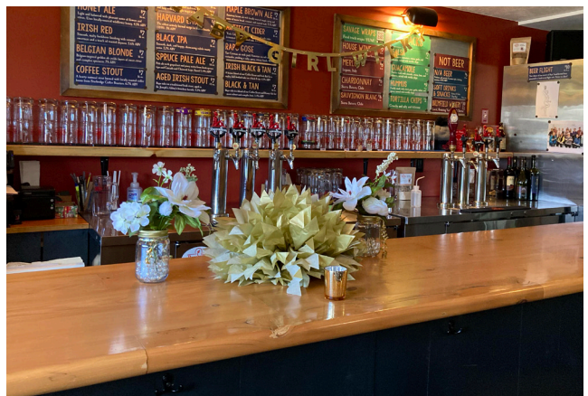
SPENCER | BREWERY & TAPROOM