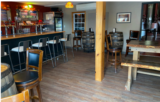
Bar in Taproom